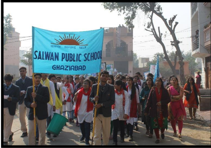
Environment Rally in the community