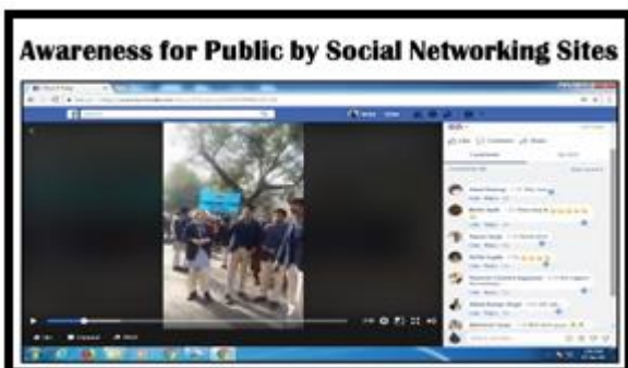
Awareness for Public by Social Networking Sites