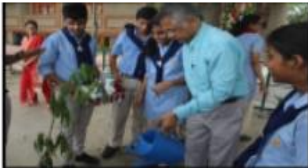
Plantation of Saplings by Chairman Trust