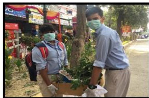
Cleanliness Drive by Students