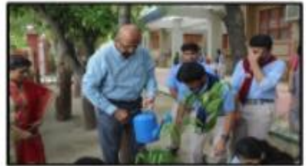
Plantation of Saplings by Chairman of the School