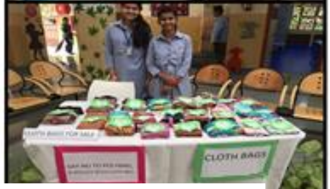
Stalls during PTM to display Cloth Bags prepared by collecting old Bedsheets, curtains