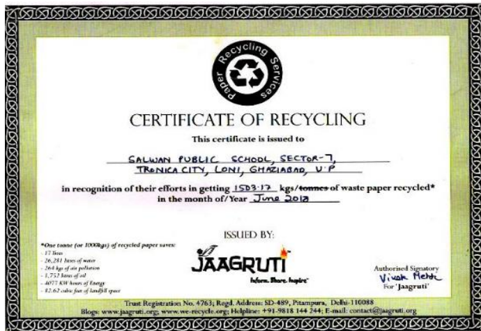
Certificate of Recycling from Jaagruti Organisation for donating recyclable waste