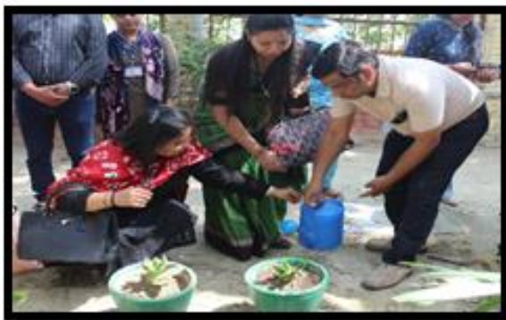
Plantation Drive by Parents and Students