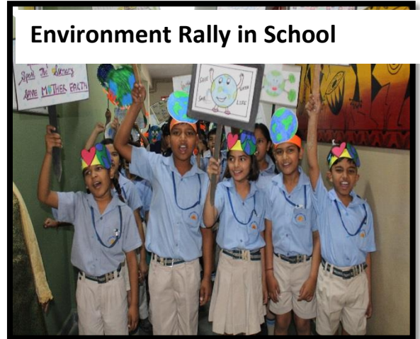
Environment Rally in School